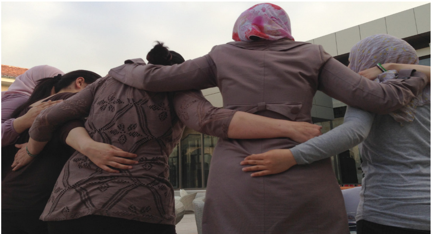
Participants gather following a USAID-supported activity to advance women's participation in peacebuilding and transition planning.