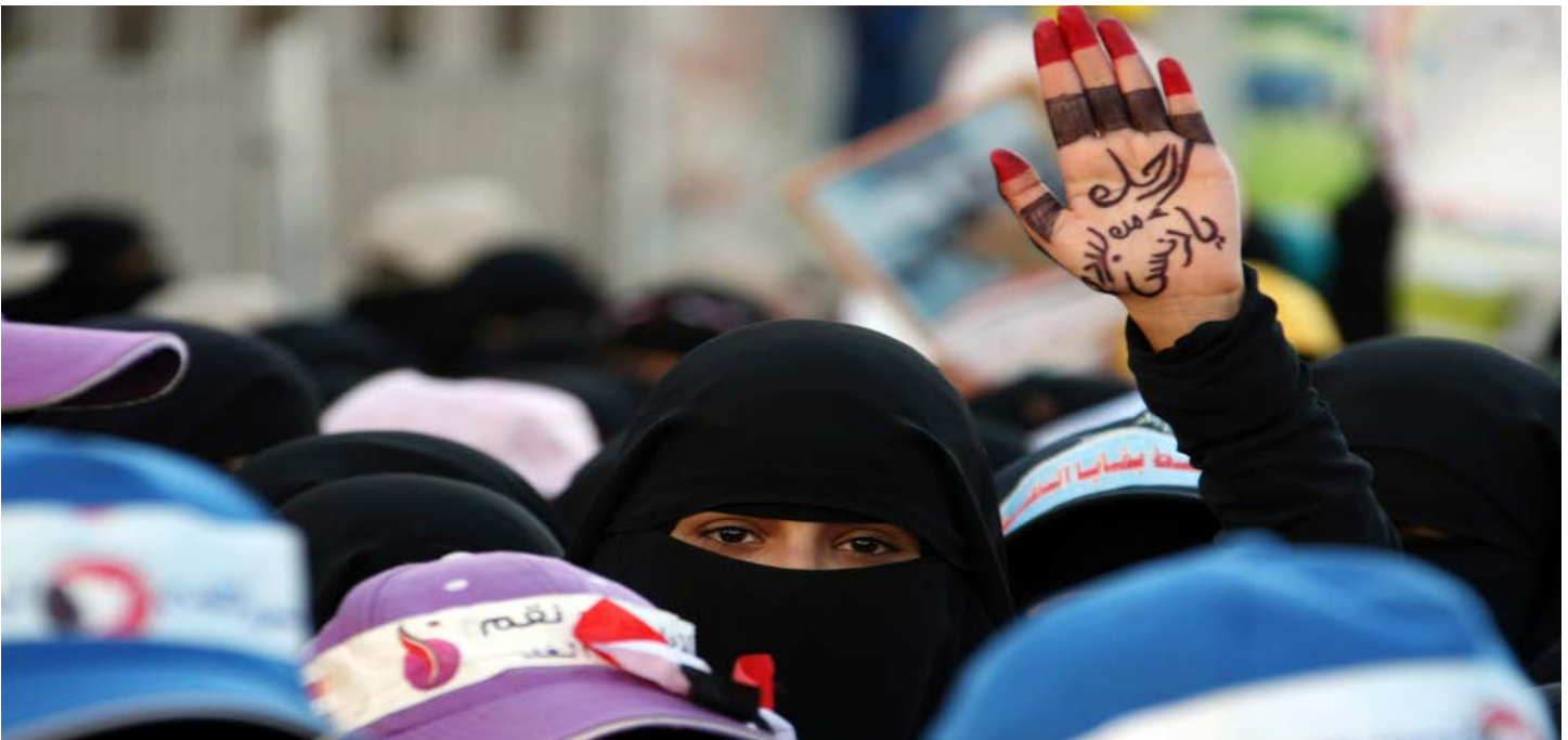
A Yemeni anti-regime protester raises her hand with the slogan "leave president" handwritten on her palm during a protest in Sanaa demanding the ouster of President Ali Abdullah Saleh.

USAID remains committed to the full implementation of the NAP and to measuring our progress in terms of changes in the lives of women and girls, and improved prospects for peace and security on the ground. We have taken some meaningful steps forward, and already we are seeing a change in the way that our Agency thinks about these issues in relation to the success of USAID's development mission. We must keep working – in partnership with our interagency colleagues, our implementing partners, and women in the countries where we work – to ensure that Women, Peace, and Security becomes a permanent part of USAID's development mission, translating into stronger results for individuals and communities .