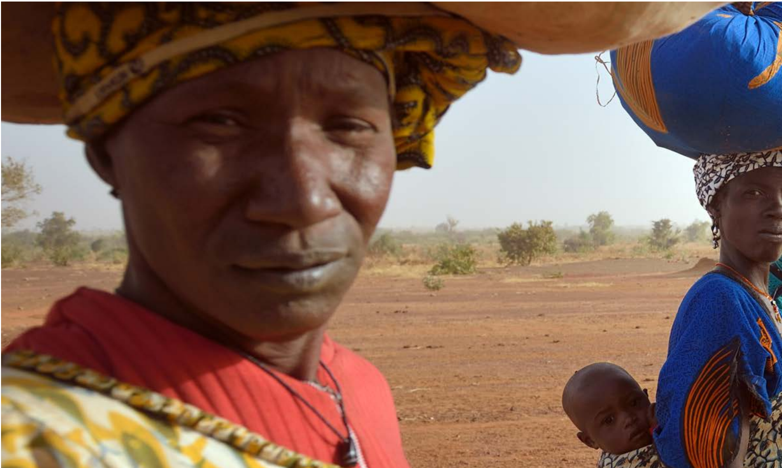
Displaced women in Mali return to their villages.

USAID is investing in gender equality and female empowerment in crisis- and conflict-affected countries to promote the rights and well-being of women and girls and to foster peaceful, resilient communities that can cope with adversity and pursue development gains. We are changing the way we do business and implementing programs to advance the five objectives outlined in the NAP: