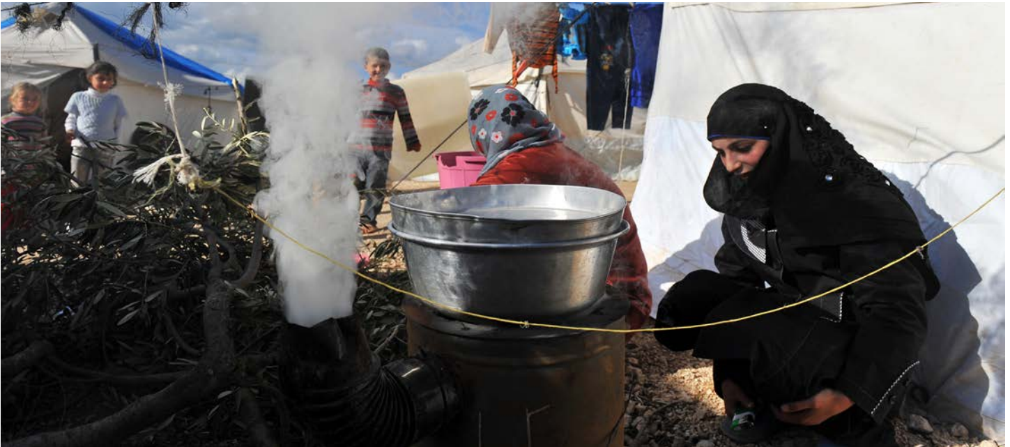
Syrian women cook food near their temporary shelters at the Qah camp for internally displaced persons along the Turkish border in the northwestern province of Idlib.

centers, including an assessment of best practices and the development of guidelines for the centers.