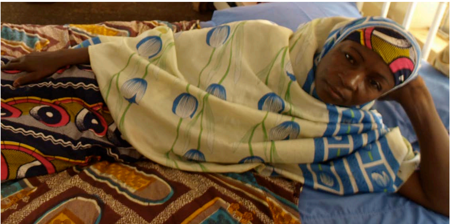
USAID/Nigeria supports fistula prevention, repair, and reintegration in seven states in Nigeria. A woman recovers at the Vesicovaginal Fistula Center at Maryam Abacha Women and Children Hospital, Sokoto, Nigeria.

The training gave 440 Afghan women the tools to become more competitive in the market, increase their monthly income, and improve the quality of life for themselves and their families. In a random sample, 84 percent of the women reported that their status within the home had improved as a result of their increased income. Before the training, some women were making as little as $10 a month. After the training, 76 percent of women reported significant increases in their income, with some earning as much as $200 per month. At least one project beneficiary reported that