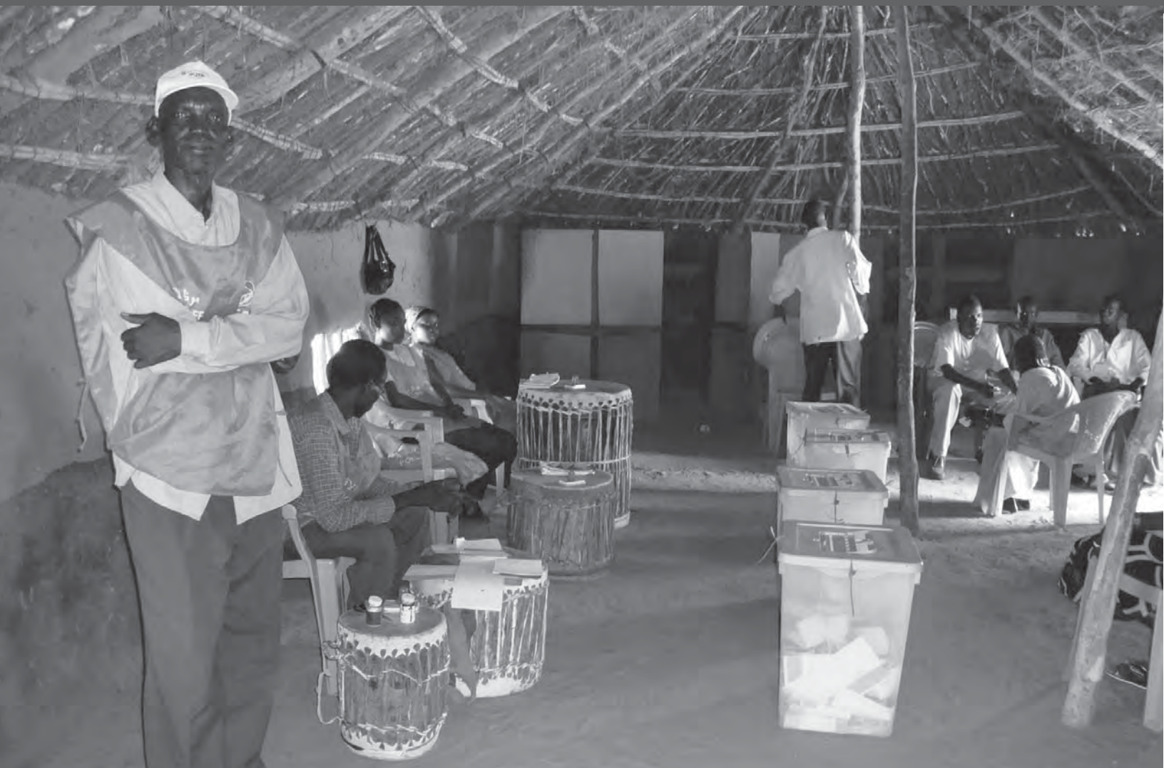
Poll workers await voters at an indoor polling station in Bentiv Biemruok, Sudan on April 13, 2010.

The foundations for a robust M&E approach were established during the Assessment, Planning and Programming phases. Building on this information, the M&E phase of the Framework will assist with defining a performance management plan (PMP). A good PMP is critical, particularly in rapidly evolving situations, for both assessing progress against desired results and testing the validity of the development hypothesis.