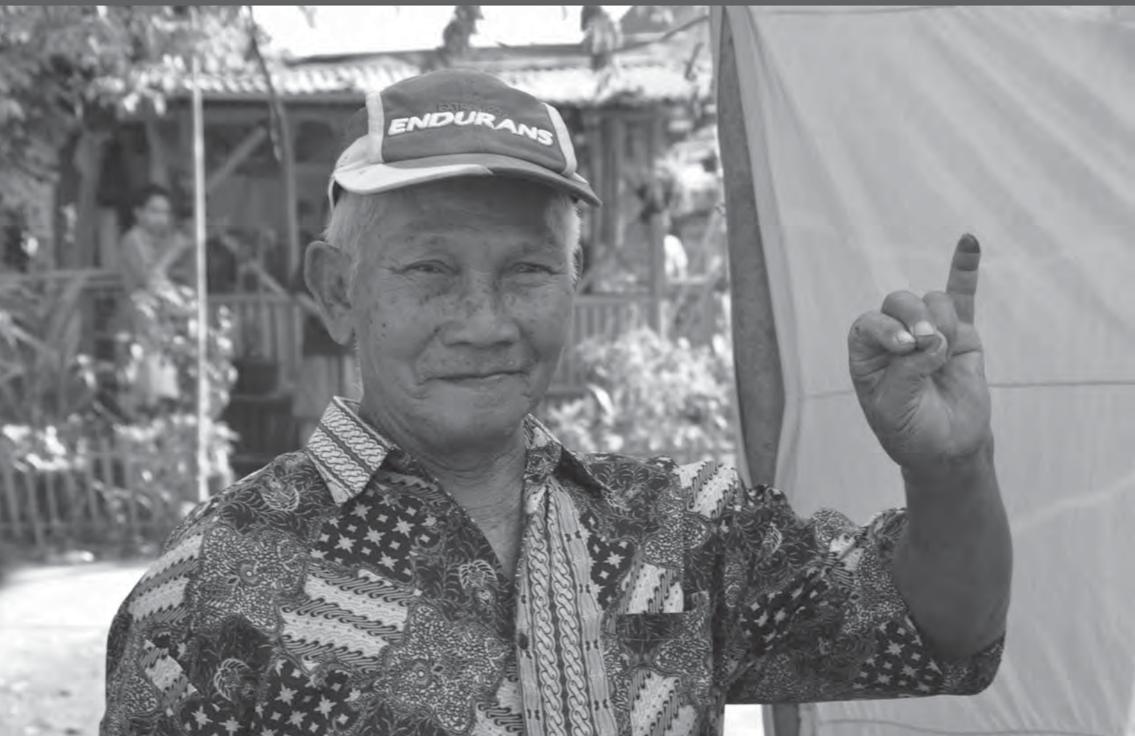
Man displays inked finger after voting in the July 2009 Indonesian Presidential Election.

Electoral conflict remains an obstacle to the consolidation of democratic institutions for many countries. Even in stable political environments, elections can fall victim to conflict. Although a problem that is global in scope, electoral conflict and its root causes, profiles and intensities differ in each country context. If development programming is not undertaken to prevent, manage or mediate electoral conflict, then elections risk becoming venues for violence and intimidation, where conflict is employed as a political tactic to influence electoral outcomes. The importance of this issue extends beyond the electoral process alone, as the legitimacy of the resulting government is also at risk in situations where conflict has been employed to achieve governance. Perpetrators of electoral conflict may act without legal consequences, engendering a culture of impunity for such crimes. Recurring elec-