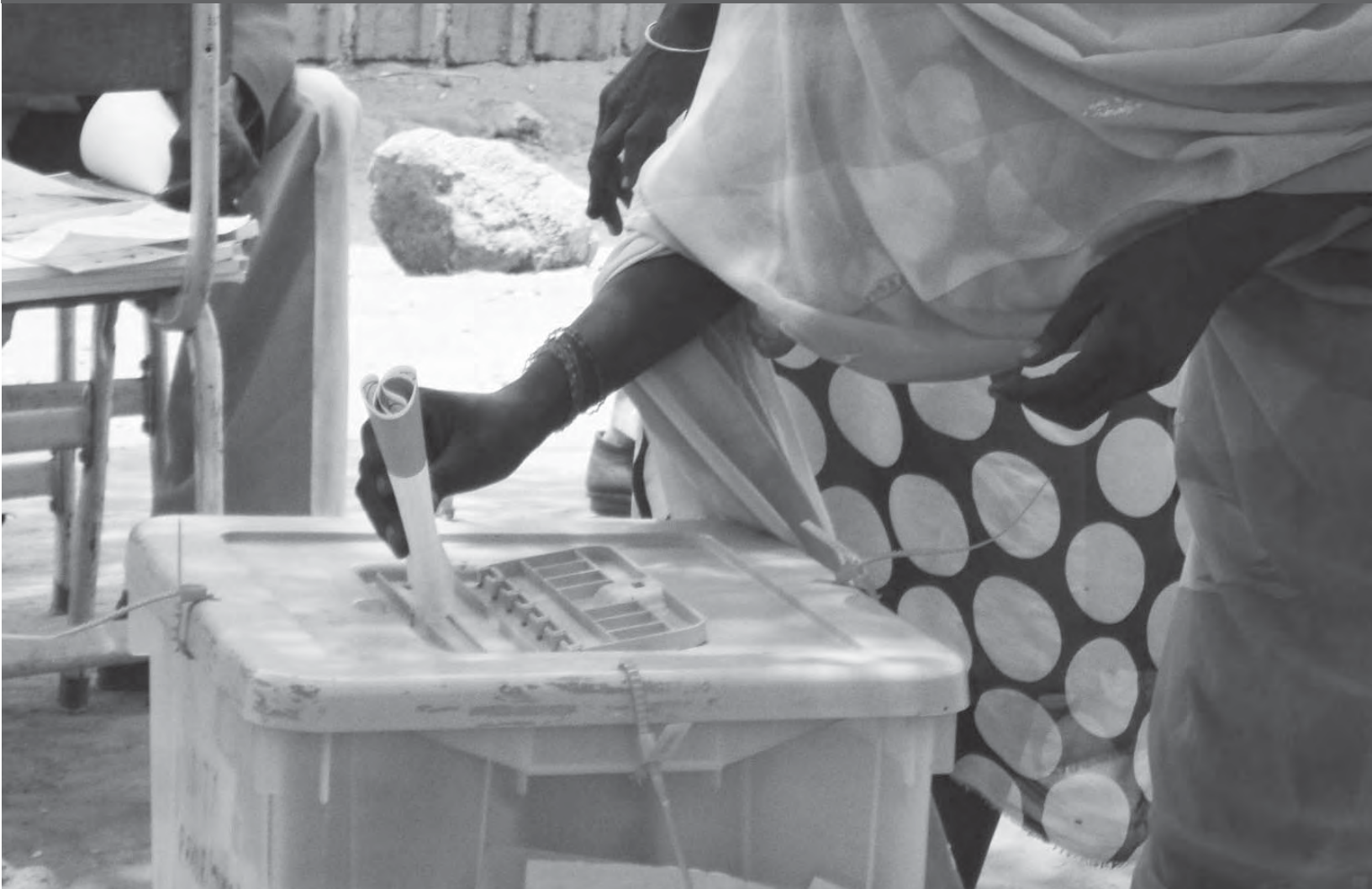
A woman casts her ballot at a Rubkona Pakur polling station in South Sudan on April 14, 2010.

This subject matter can be introduced through a trio of fundamental definitions: 1) electoral security; 2) electoral conflict; and 3) electoral justice. Electoral security is the end-state; electoral conflict is the development challenge; and electoral justice is one of the key mitigating factors. These three concepts are discussed in tandem because they collectively embody electoral conflict dynamics.