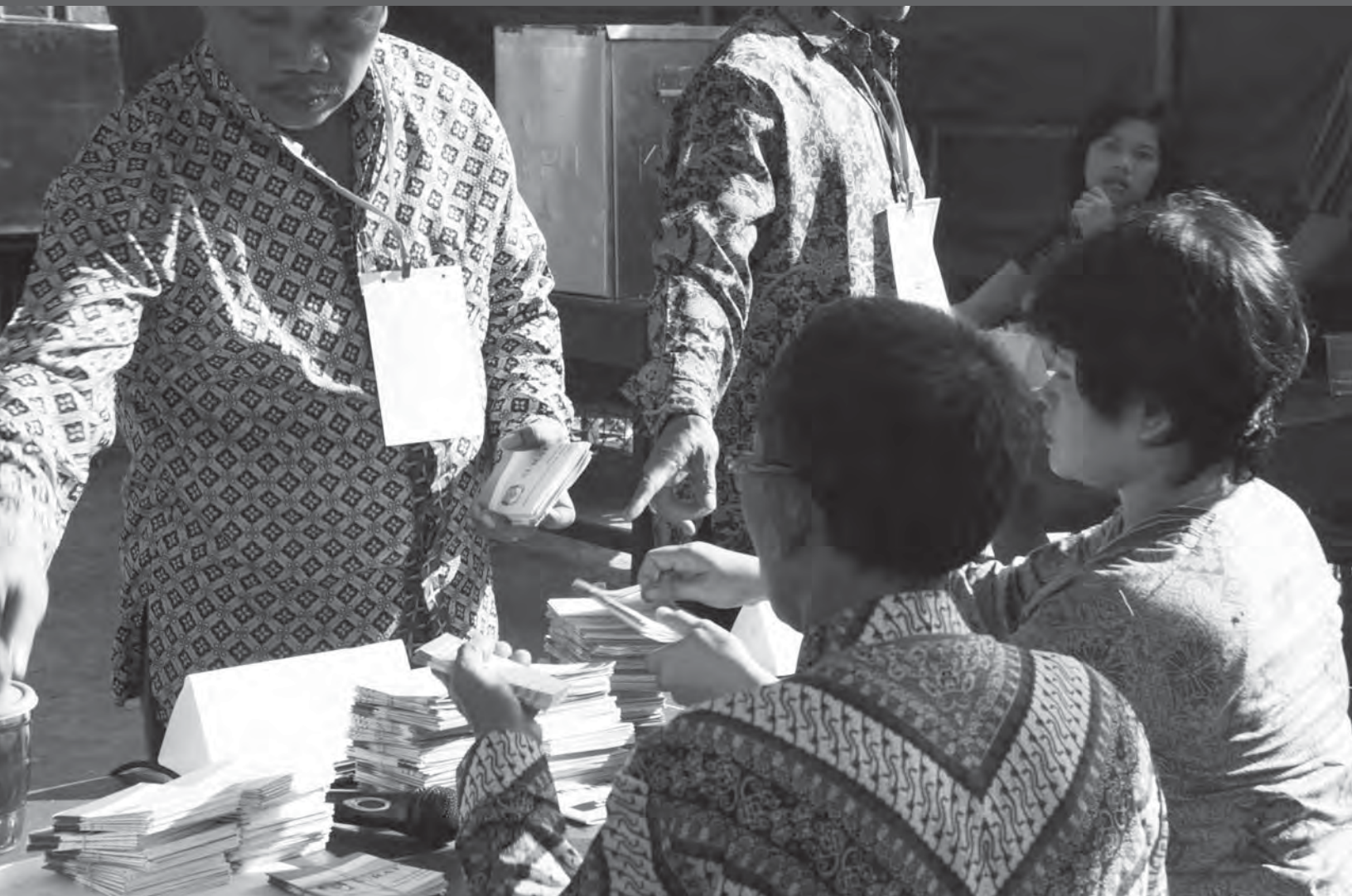
Poll workers sort ballot materials in advance of the July 2009 presidential elections in Indonesia.

Electoral security programming is intended to develop legal architectures guiding state and non-state stakeholders in the capacity to prevent, manage or mediate electoral conflict. Such programming involves both rules-based and values-based approaches to ensure peaceful electoral competition and post-election reconciliation.