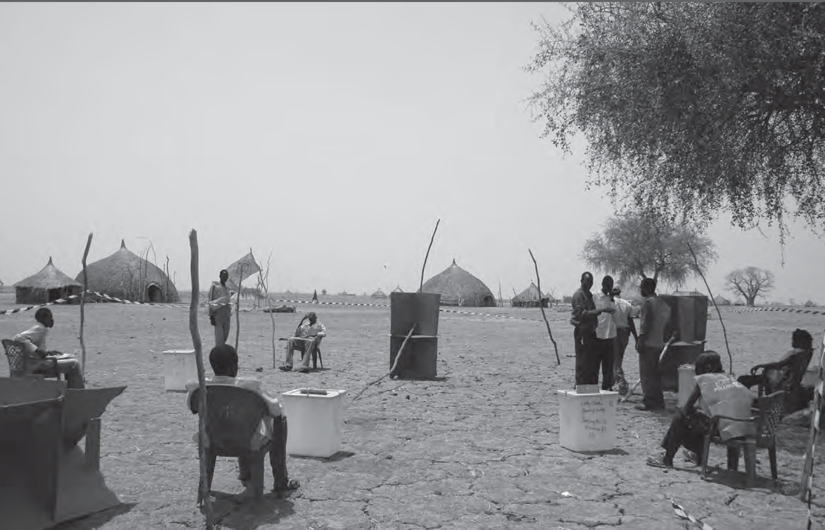
Polls workers prepare to receive voters at an outdoor polling station in rural Jamjang Mankuo, Sudan on April 11, 2010.