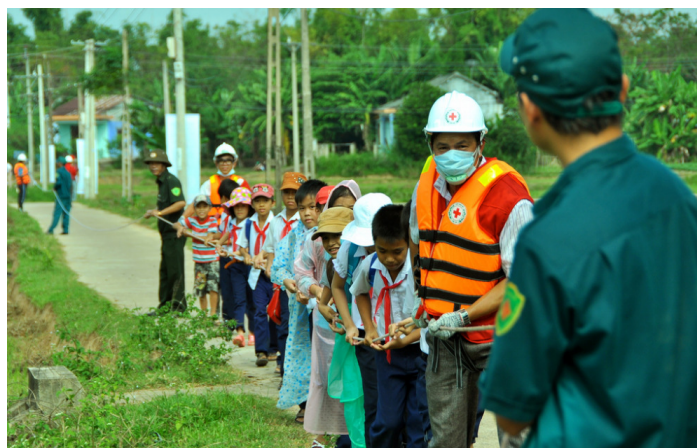
Vietnam Red Cross CADRE Team conducts a disaster response simulation exercise.

VFD has made significant contributions to helping local communities increase the resilience of people, places and livelihoods in delta areas. Results were achieved through implementing community-based disaster risk assessments, school-based disaster preparedness activities, enhancement of emergency response (PEER) organizations, and assessing and upgrading effective early warning systems (EWS). VFD plans to implement these activities in 60 communes in Nam Dinh and Long An. All of VFD's activities in this component directly support the GVN's natural disaster risk management program (Prime Minister's program 1002).