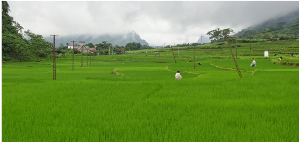
VFD supports the cultivation of climate-resilient rice in Nam Dinh and Long An provinces.

Under a new initiative, VFD is exploring the possibility of working with the Ho Chi Minh Academy to develop a curriculum for climate change training for government officials. This approach offers promise in terms of being an effective and sustainable way to reach a large number of government officials.